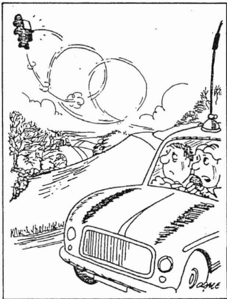
Looks as though you're getting interference from aero-modellers good buddy!